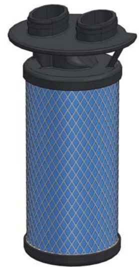
Depth Filter UltraPleat® S